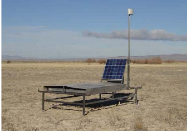
Figure 1. A scintillation surface detector deployed in the field for the Engineering Array test.

Scintillator platforms are to be constructed of 2 inch square tubular steel legs and frame. Scintillators with fibers and PMTs will be contained in a 2.3m x 1.7 m x 10cm high stainless steel box, which lies on top of the platform and is covered with a thin steel roof in order to avoid sunlight and rain. The solar panel is installed on top of the platform at a 60 degree angle. Behind and below the solar panel will be a metal enclosure containing the storage battery and electronics boards. A lightweight 10 ft. antenna would be attached to each platform. The over-all dimensions of each detector is 7 ft. wid, 12 ft. long, and 6 ft high (not including the antenna).