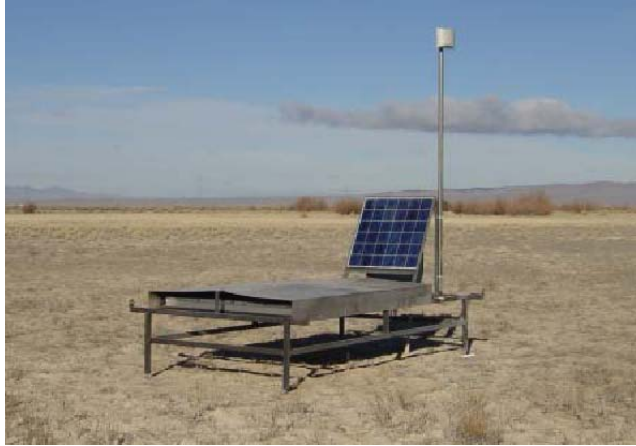
Figure 1. A scintillation surface detector deployed in the field for the Engineering Array test.

Scintillator platforms are to be constructed of 2 inch square tubular steel legs and frame. Scintillators with fibers and PMTs will be contained in a 2.3m x 1.7 m x 10cm high stainless steel box, which lies on top of the platform and is covered with a thin steel roof in order to avoid sunlight and rain. The solar panel is installed on top of the platform at a 60 degree angle. Behind and below the solar panel will be a metal enclosure containing the storage battery and electronics boards. A lightweight 10 ft. antenna would be attached to each platform. The over-all dimensions of each detector is 7 ft. wid, 12 ft. long, and 6 ft high (not including the antenna).